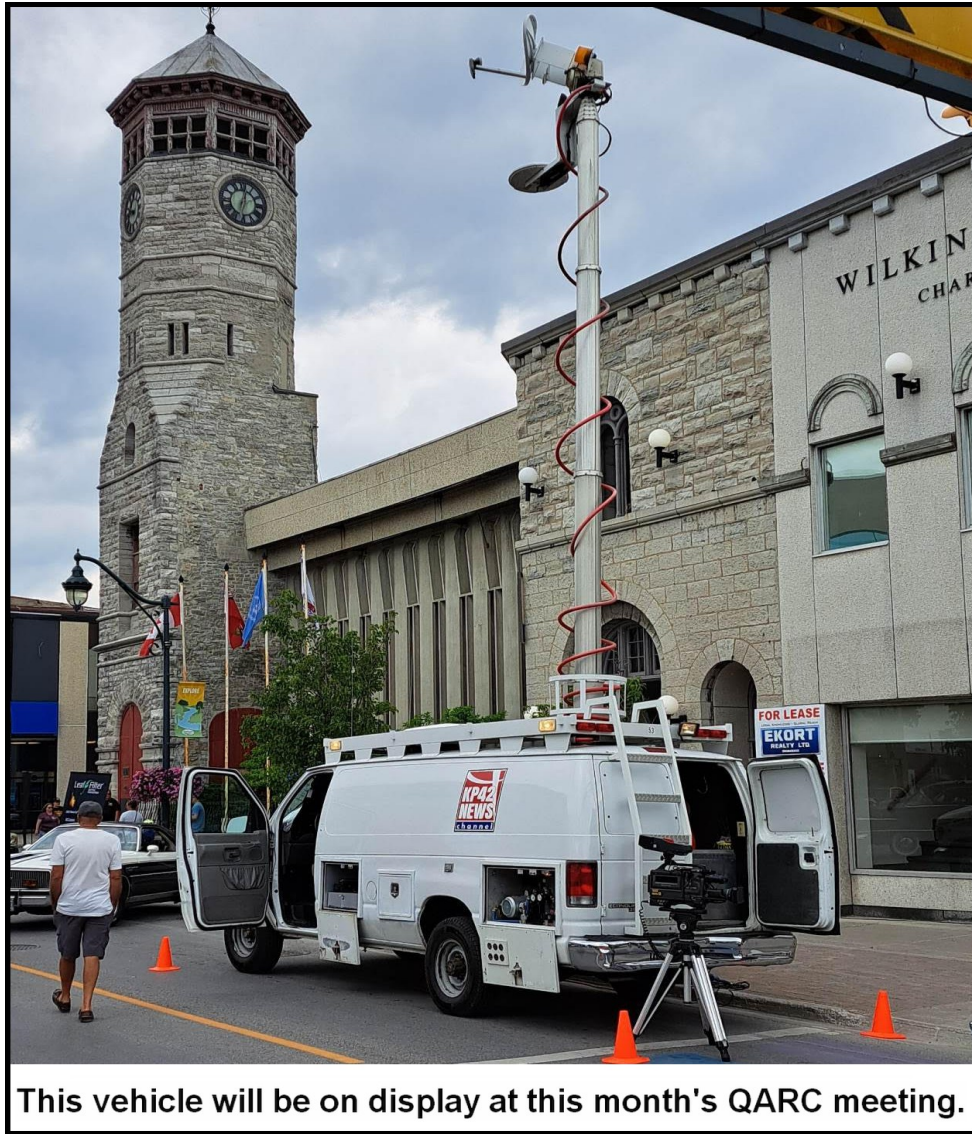
This vehicle will be on display at this month's QARC meeting.

This classic News gathering vehicle, owned by Barry Silverthorn, will be on display at this month's meeting on Monday September 18.